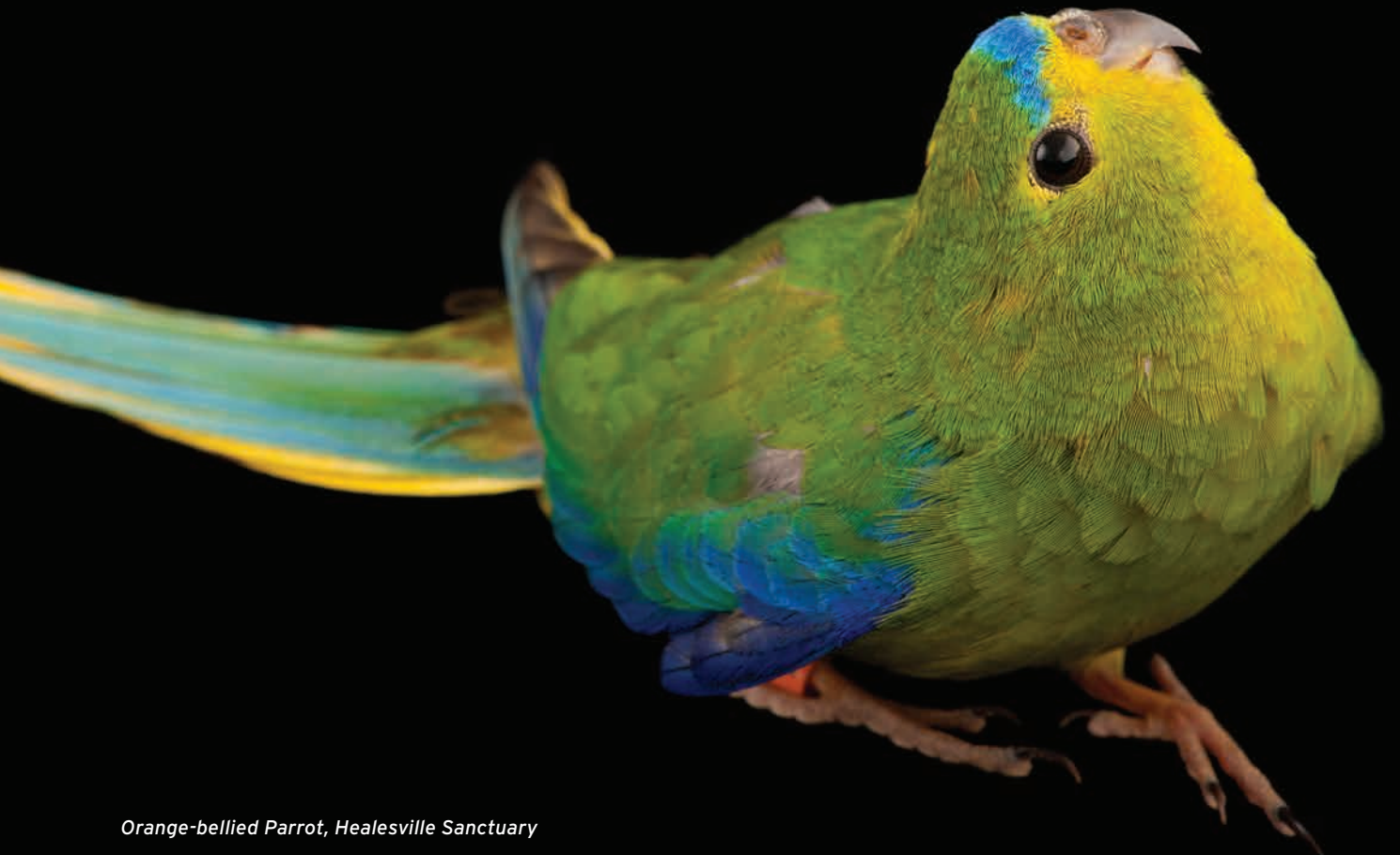
Orange-bellied Parrot, Healesville Sanctuary