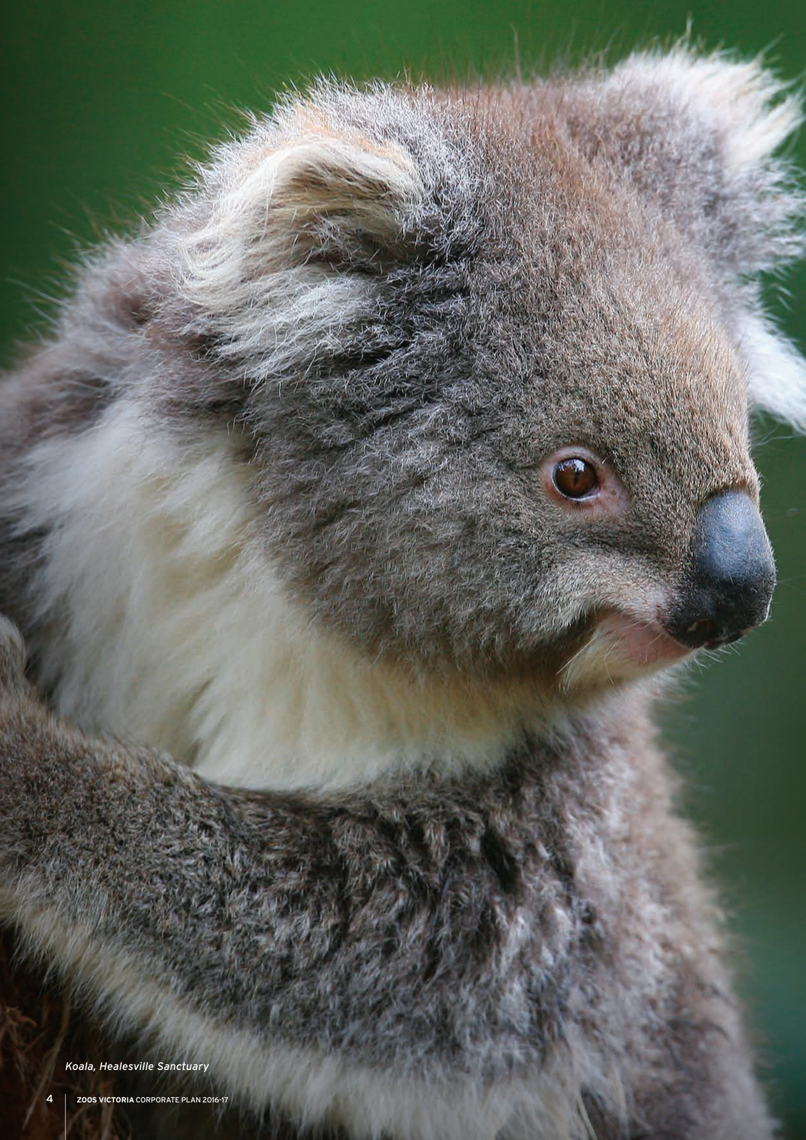
Koala, Healesville Sanctuary